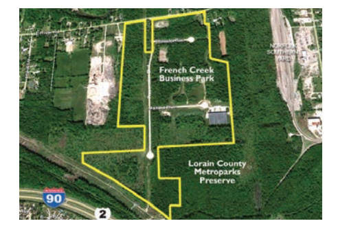
French Creek Business Park Sheffield Village, Ohio

200,173 SF Industrial Investment Sale Buyer & Seller Representation