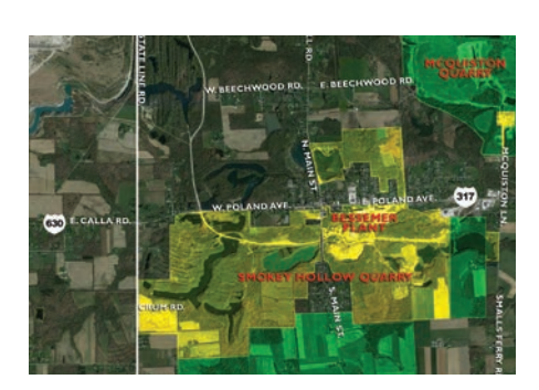
ESSROC Land Western PA & Eastern OH

316,800 SF Industrial Lease Landlord Representation