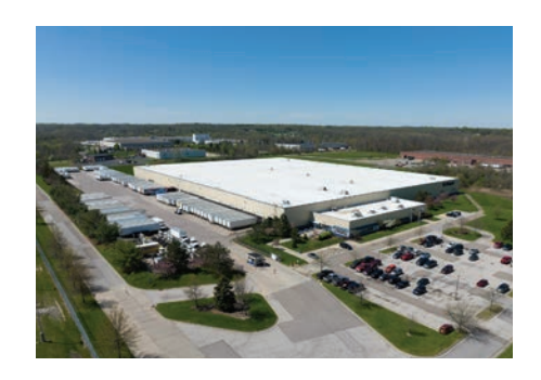
9777 Mopar Drive Streetsboro, Ohio 343,416 SF Industrial Lease Tenant Representation