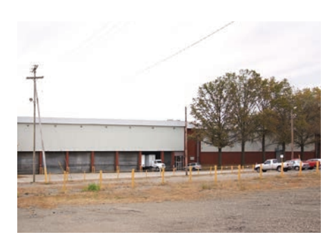
334 Orchard Avenue NE North Canton, Ohio

94,000 SF Industrial Lease Landlord Representation