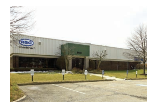
9450 Allen Drive Valley View, Ohio

492,068 SF Industrial Sale Seller Representation