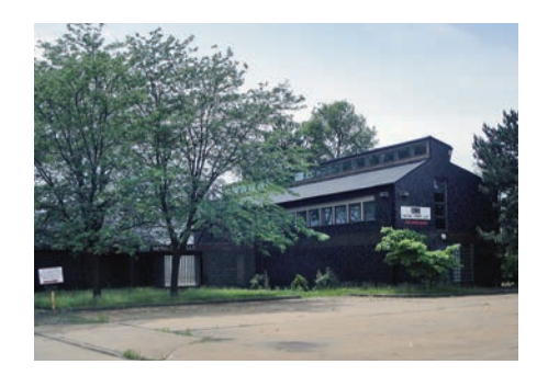
5800 Sterling Avenue Maple Heights, Ohio 170,000 SF Industrial Sale Buyer Representation