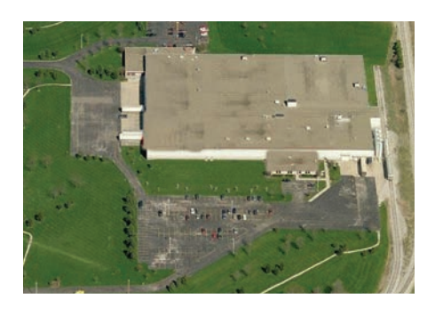
600 Modial Parkway Streetsboro, Ohio 173,315 SF Industrial Sale Buyer Representation