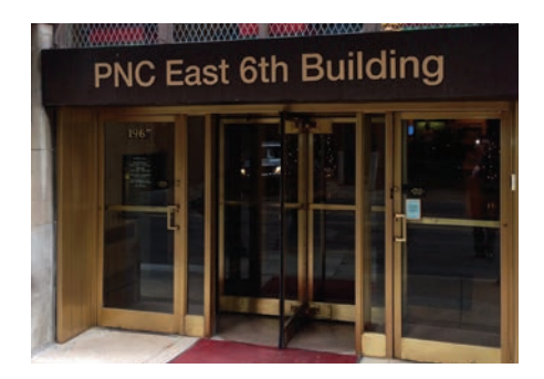
1965 E. 6th Street Cleveland, Ohio

451,020 SF Industrial Lease Landlord Representation