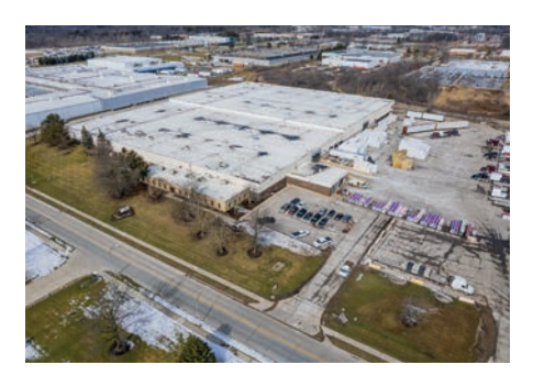
30301 Carter Street Solon, Ohio 219,574 SF Industrial Lease Landlord Representation