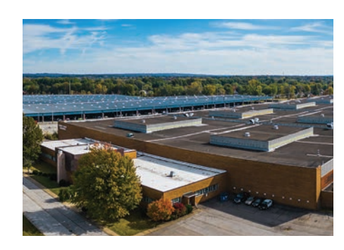
18901 Euclid Avenue Cleveland, Ohio 258,404 SF Industrial Sale Buyer Representation