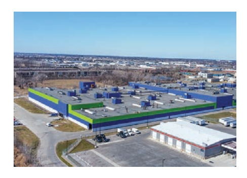
Parma, Ohio 392,454 SF Industrial Lease Landlord Representation