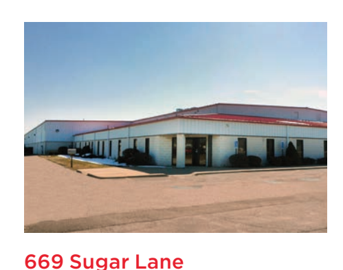
Elyria, Ohio 136,920 SF Industrial Lease Landlord & Tenant Representation