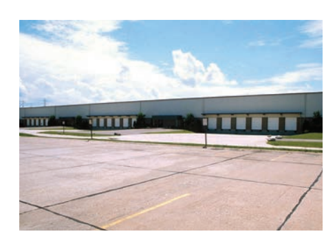
101-151 Liberty Court Elyria, Ohio

100,979 SF Industrial Sale Seller Representation