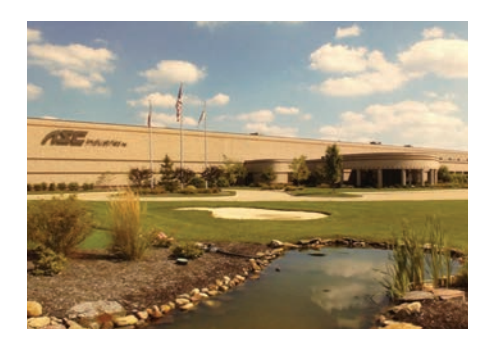
2100 International Parkway Green, Ohio 285,000 SF Industrial Lease Tenant Representation