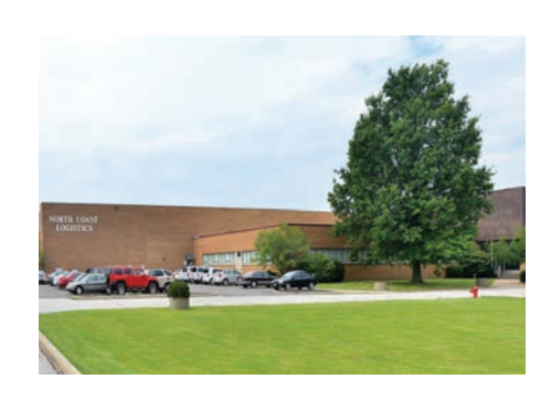
18901 Snow Road Brook Park, Ohio

350,000 SF Industrial Lease Tenant Representation