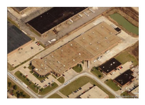
7333 Corporate Boulevard Mentor, Ohio

158,319 SF Industrial Sale Seller Representation