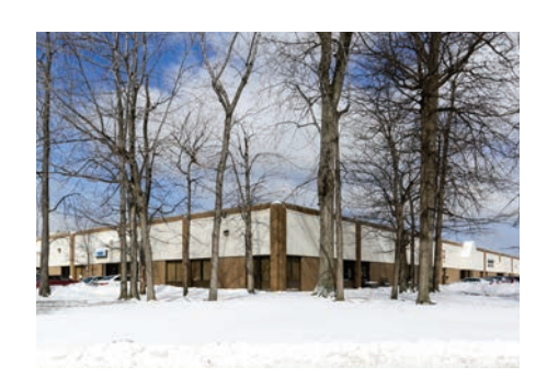
34525 Melinz Parkway Eastlake. Ohio

220,000 SF Industrial Lease Landlord Representation