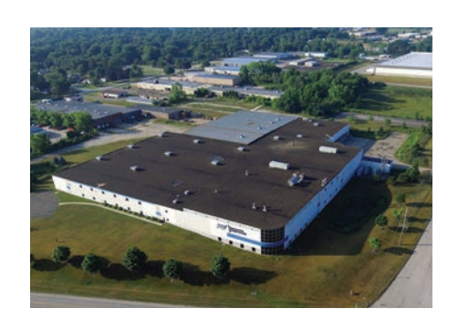
858 Seasons Road Stow, Ohio 140,970 SF Industrial Lease Landlord Representation