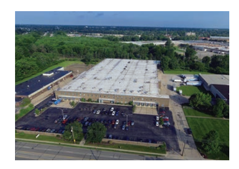
4600 Tiedeman Road Brooklyn, Ohio 241,496 SF Industrial Sale Seller Representation