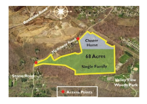
Hathaway Road Valley View, Ohio

139,130 SF Industrial Lease Tenant Representation