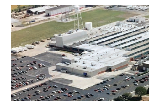
1600 N. Union Street Fostoria. Ohio

492,068 SF Industrial Sale Seller Representation