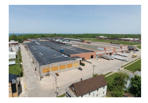
Cleveland, Ohio 443,295 SF Multi-Tenant Investment Sale Seller Representation