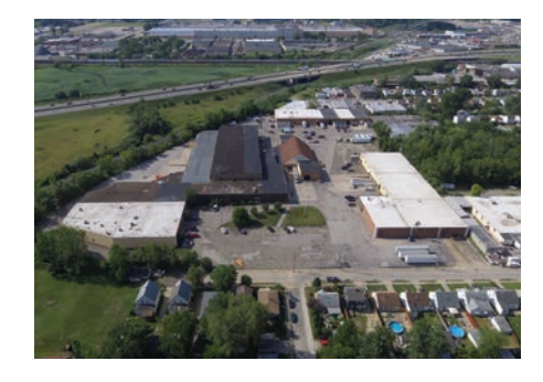
12117 Bennington Avenue Cleveland. Ohio

100,000 SF Industrial Sale Buyer & Seller Representation