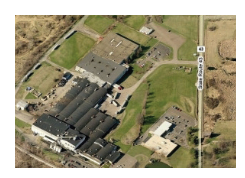
State Route 61 & 43 Hartville, Ohio

158,319 SF Industrial Sale Seller Representation