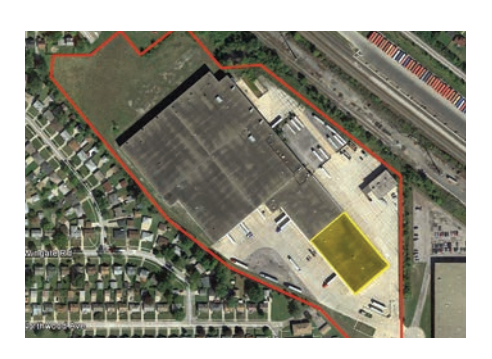
5700 Lee Road Maple Heights, Ohio

118,570 SF Industrial Lease Tenant Representation