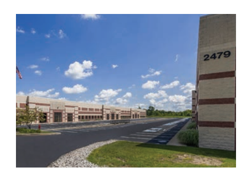
2477-79 Edison Boulevard Twinsburg, Ohio 206,407 SF Industrial Lease Landlord Representation