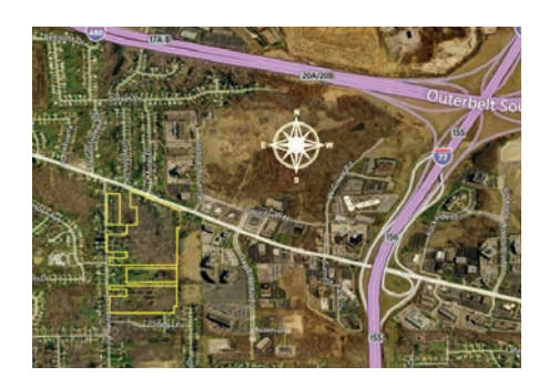
Rockside Road Seven Hills, Ohio 44 Acre Commercial Land Sale Seller Representation