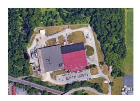
1301 Lowell Street Elyria, Ohio

207,132 SF Industrial Lease Tenant Representation