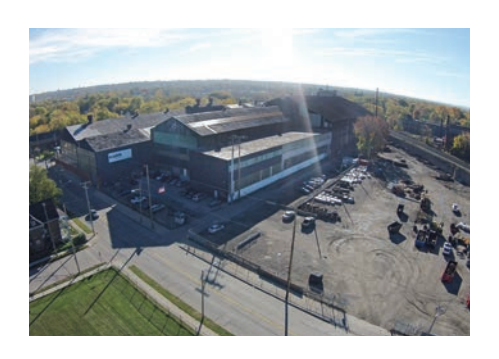
7000 Central Avenue Cleveland, Ohio 260,031 SF Industrial Sale Seller Representation

220,000 SF Office/Research BTS Buyer Representation