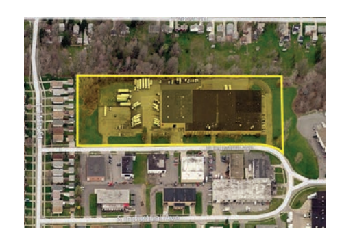
14301 N. Industrial Avenue Maple Heights, Ohio

186,081 SF Industrial Sale Buyer Representation