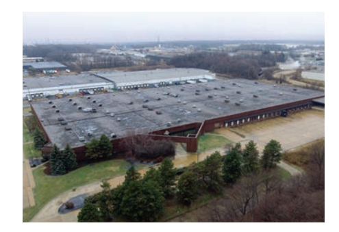
1793 Enterprise Parkway Twinsburg, Ohio 306,010 SF Industrial Sale Seller Representation