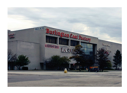
21201 Northfield Road North Randall, Ohio 199,264 SF Retail Sale Seller Representation