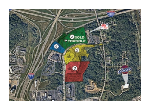
Independence, Ohio 16.2 Acre & 16.3 Acre Commercial Land Sale Seller Representation