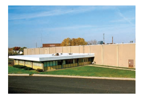
7000 Denison Avenue Cleveland, Ohio

103,830 SF Industrial Sale Seller Representation