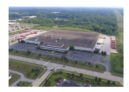
Solon, Ohio 308,500 SF Industrial Sublease Tenant Representation